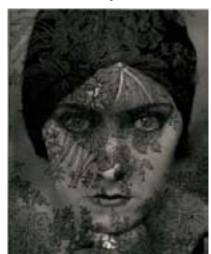
Edward Steichen,Gloria Swanson, 1928

Steichen would take full advantage of the resources and prestige conferred by the Condé Nast empire to produce an oeuvre of unequalled brilliance, putting his exceptional talents and prodigious energies to